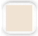
Broken White EPL 314