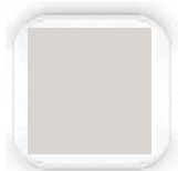
Polar Mist EPL 269